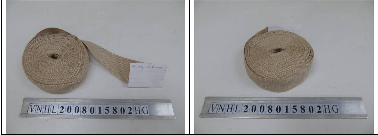
PHOTO OF SUBMITTED SAMPLE FOR TESTING